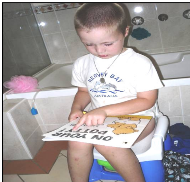
Hunter Reads On Your Potty

I'm sure this will bring a smile to your face!