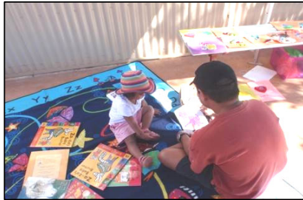
A father and his daughter reading

them. We have also found that the parents or carers have the DVD to watch so this helps them as well.