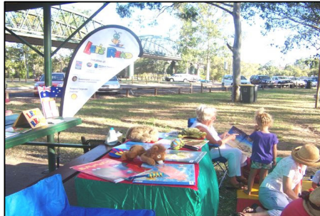
Volunteers reading at the Australian Family Fun Day

Let's Read is maintaining a high profile in the Bundaberg region with a new read aloud session beginning in February at Sugarland Shoppingtown. The two major shopping centres in Bundaberg have shown great support to our read aloud sessions. Regular volunteers Flora, Robyn, Chris and Cathryn continue their fantastic commitment to Let's Read and we have had plenty of interest from members of the public to come on board and train to be Let's Read volunteers.