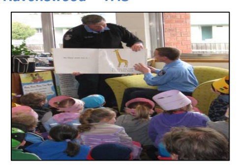
Fireman reading "Dear Zoo"

On Wednesday, 18<sup>th</sup> August, 100 children and their families met at the Launching into Learning room at Ravenswood Heights Primary School. Some friendly firemen arrived and took groups of children for turns sitting in the truck and with the fire hose. They then came in and read 'Dear Zoo' to the children. What an exciting way to start the day!