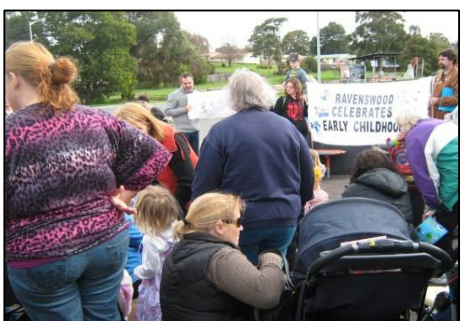
Book Week Celebration at Ravenswood

Local Facilitator Families at Farmborough School Community Centre