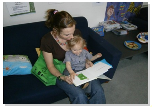
A mum reading along with her 1 year old

The Doveton Family Resource Centre held a First Birthday Party for children who will be turning one. Let's Read has become a large part of the celebration. Towards the end of the party, a Let's Read pack was handed to every child and parent and discussions about reading with children occurred for each parent. A staff member then read 'Dear Zoo', with parents reading along with their child. They put the animals from the book in a box for the children to open and play with. The parents commented on the different approach which was used to interact with the book.