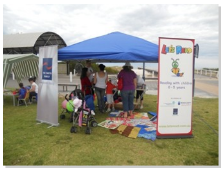
Playgroup in the Park Event

On October 21, Le's Read was delivered at the launch of the City of Onkaparinga's National Children's Week by having a Playgroup in the Park Event at Christie Downs Community House. The event included face painting, a jungle castle, Animal Capers and craft activities. Also the library had a reading area and activities specifically for children with disabilities. Approximately 24 families received Let's Read packs, the youngest child being 8 weeks old. Another child had received Let's Read previously and had every book that we had in our packs; it was great to see that he knew the books well and Let's Read books are being utilized at home.