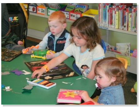
Children's 3D creation of a forest

At the beginning of the session, the Salisbury North Learning for Life Worker talked about The Smith Family, and in more detail about the Let's Read program. There was a very positive response from the 15 families who attended the session and each parent and child received a Let's Read pack. During the session, a library staff member read a series of books focused on forestry as this year is